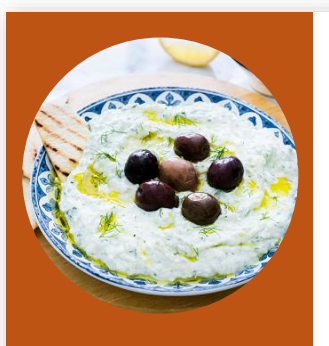
Optional : Olive oil, olives, spices, cucumbers

Halloumi: calcium, protein Veggies: vitamin C, antioxidants