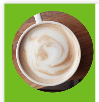
Optional: cocoa powder, ice

Labneh: protein, calcium, probiotics Whole grain pita: fiber, B vitamins